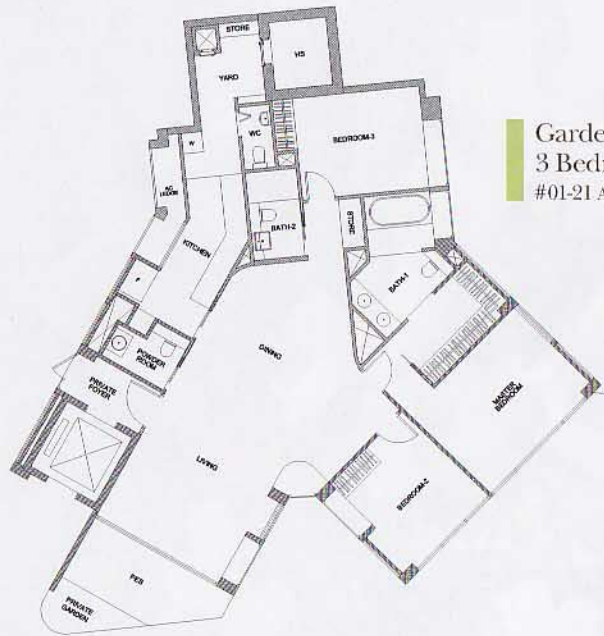
Garden Villa 3 Bedroom C16p #01-21 Approx. 164 sqm / 1,765 sq ft