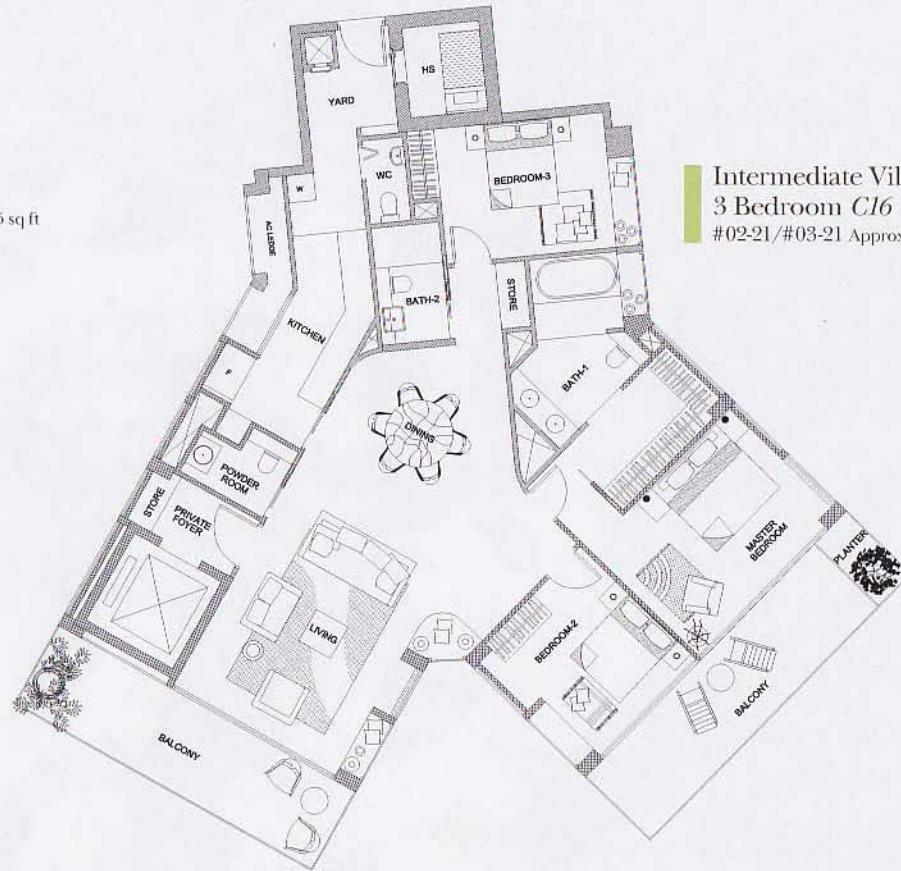
Intermediate Villa 3 Bedroom C16 #02-21/#03-21 Approx. 186 sqm / 2,002 sq ft